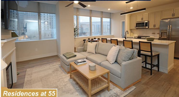
Residences at 55

K&D WOULD LIKE TO WELCOME YOU HOME TO ONE OF OUR MANY COMMUNITIES DESIGNED TO SUIT ANY LIFESTYLE.