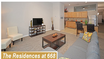
The Residences at 668

You have your choice of more than 20 locations in the greater Cleveland area, each with unique qualities characteristic to K&D. Our communities feature: